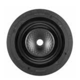
VX86R SST SKU 93686